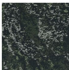
Moss 15326 LRV 8.2