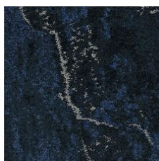
Coast 15456 LRV 3.2