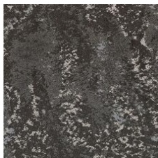
Ridge 15580 LRV 10.2