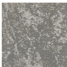
Dune 15105 LRV 22.8