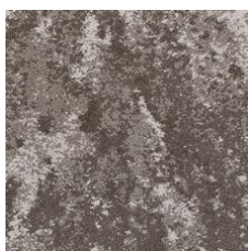
Canyon 15180 LRV 14.8