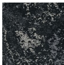
Vast 15505 LRV 2.7