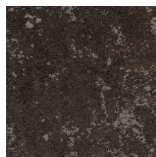
Slope 15518 LRV 7